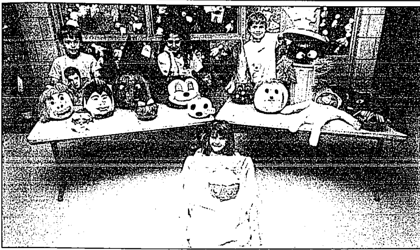
RANDY BORST/staff photographer