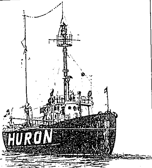
The "Huron" was always on the Corsica Shoal in Lake Huron, and the ship in this picture is Light Vessel 103 which was decommissioned in August 1970. At that time, it was the oldest lightship in the Coast Guard. It is now a museum in Port Huron's Pine Grove Park. Pen-and-ink drawings of this lighthouse along with 11 other Great Lakes lights are featured in the "Great Lakes Lights" 1990 calendar available directly from the Historical Society of Michigan.