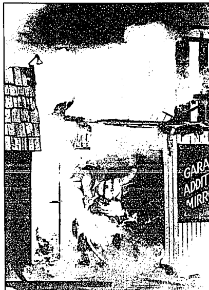
Firefighters attacked the fire from inside the building as well as outside.