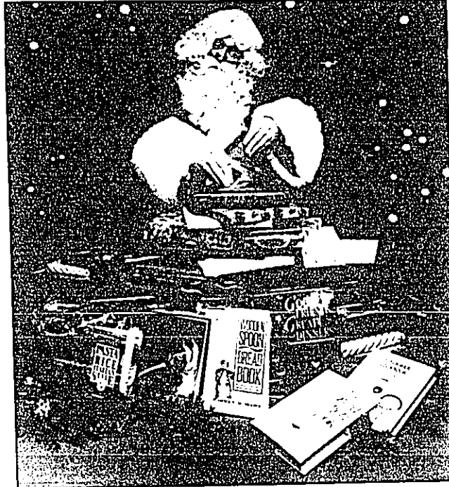
Gifts for the gourmet include kitchen appliances, gadgets and the latest cookbooks.

'... a number of works this holiday season are worthy additions to any cookbook collection. As a matter of fact, they're the best the culinary world has offered for a few seasons.'