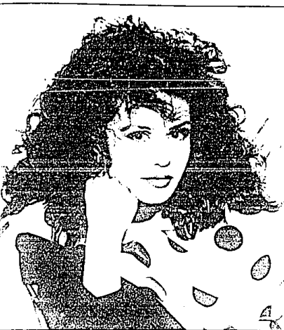
Mario Osmond stars in "The Magic of Christmas" with the Osmond Brothers at 8 tonight at the Palace of Auburn Hills. For ticket information, call 377-8600.