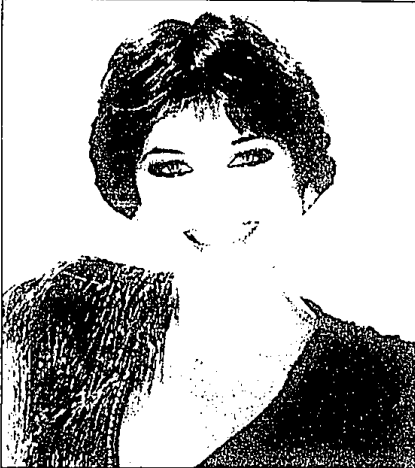
Dorothy Hamill stars in "Broadway on Ice," opening Tuesday, Jan. 30, at the Fox Theatre in Detroit.