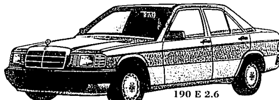
190 E 2.6

This 4N sales tax Fully equipped including automatic transmission and air conditioning. Based on a 60 month closed end lease. 1st payment and 4N fee in advance. 75,000 mile limitation. Total obligation in payments $413.10, plus 4N Use Tax. Buyer has option to purchase at lease end at guaranteed purchase price.