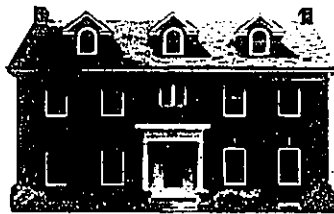
15-Year Fixed Rate Mortgage: $90,000.