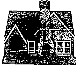
15-Year Fixed Rate Conventional Mortgage: $70,000.