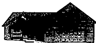
1-Year Adjustable Rate Mortgage: $55,000.