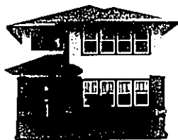
30-Year Fixed Rate MSHDA Mortgage: $33,250.