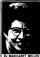
By MARGARET MILLER

Sleeping facilities include such items as inner-spring or foam-rubber mattresses, dinettes which convert into double beds, fold-down units and tricky arrangements which allow maximum use of space in both daytime and nighttime.