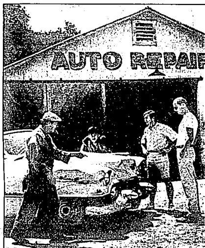
In scene from "Coupe de Ville," mechanic and brothers deal with the damage to the family car. The movie sets the story in the '60s instead of the '50s when the events of "the Cadillac story" actually occurred.