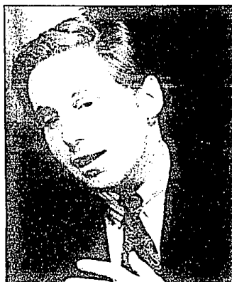
"Coupe de Ville," he was on the set every day during filming