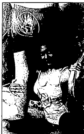
His suit is bright blue and purple boxers by Body Glove ($34) and here is a yellow one-piece tie dye stretch by Too Hot Brazil ($52), both from Don Thomas.