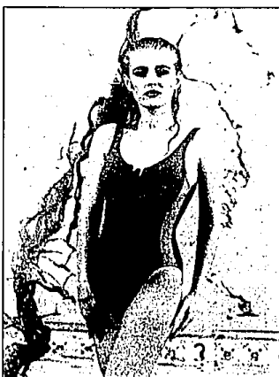
Hot pink is mixed with green and purple for this zippered one-piece suit ($55) from Roslyn's.