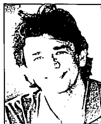
Adrian Zmed is Jesus in "Jesus Christ Superstar," coming to the Birmingham Theatre.

The Farmington Community Band, in conjunction with the Farm-