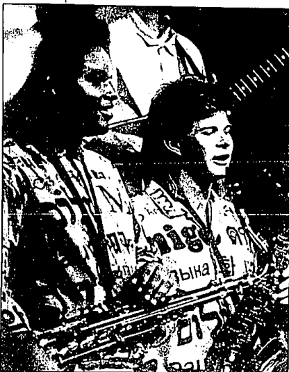
Up With People will appear at 7:30 p.m. Wednesday, May 1, at Athens High School in Troy. An international cast of 195 young people is in the show. For more information, call Troy Adult Education at 879-7582.