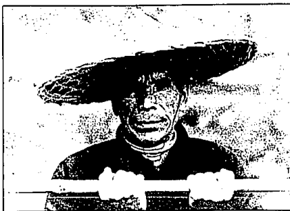
Monte Nagler used a telephoto lens to move in close for impact. The use of a large aperture blurred an unwanted background.