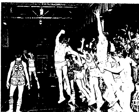
THIS WAS SCENE at the Bentley High bench after nipping Plymouth in the all-important Suburban Six League game. The Bulldogs won to all but clinch the championship.

Welcome Wagon SOUTHFIELD 358-0065 FARMINGTON 851-5241 LIVONIA 484-1318 PLYMOUTH 453-5388