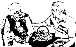
The Farmington Hills Inn

We can make your decision easier. Accept our invitation to visit us for a cup of coffee and a tour. Give us a call for our brochure.