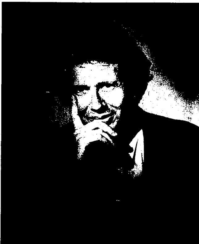
Gary Shandling has won over crowds with his routines, which involve the audience and leave them the feeling that they really know him, that he's just a regular guy.