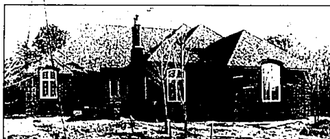
ELEGANTE III - NEW

New Majestic French Traditional in exclusive gated development of only 20 custom homes. 5,000 - sq. ft. featuring 2 story great room, formal living room and dining room, 4 bedrooms, 4 1/2 baths, 3 fireplaces, 2 staircases, 3 1/2 car rear entry garage, 1 1/3 acre wooded lot. Truly a custom residence with numerous other fine features. 15 days to completion. $795,000.