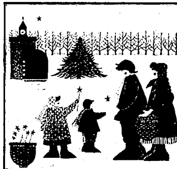
B. Bourgeois-Richards 1987