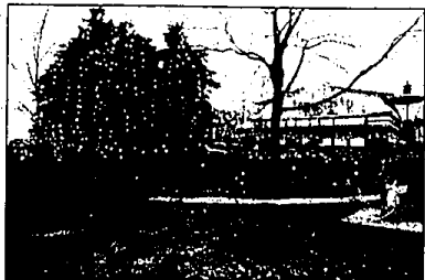
About 48,000 lights were used to decorate the house and grounds of the Shamie family in the southwest corner of Farmington Hills.