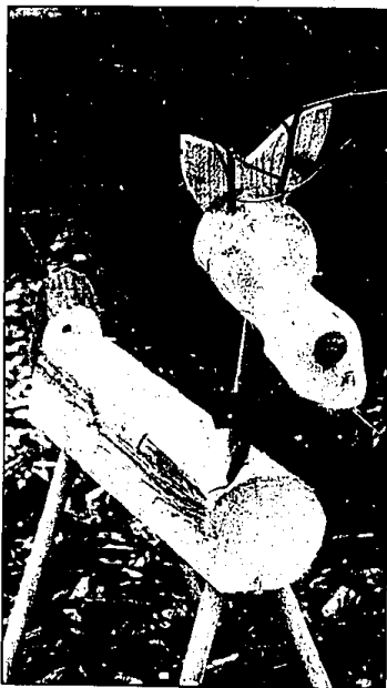
This stately wooden deer stands guard at the entrance of Country Ridge Subdivision in the 14 Mile and Halsted area.