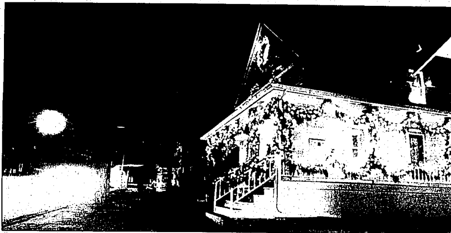
A home in Farmington's Historic District is bright enough to light up a couple of blocks on Farmington Road between Grand River and Shiawassee.

We didn't have to comb all the streets looking for the festive and decorative houses. It seems as though the decorations were just there, all dressed up, waiting to have their pictures taken.