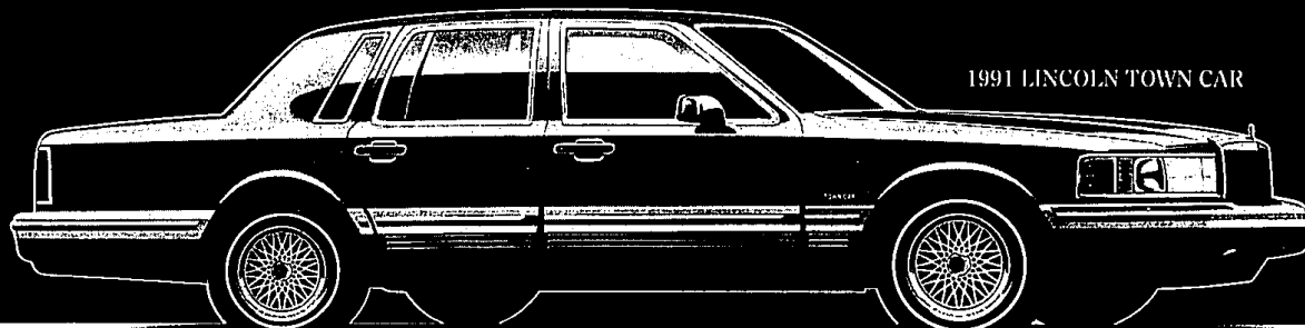
1991 LINCOLN TOWN CAR