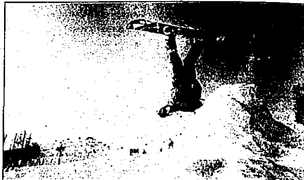
HEAD OVER HEELS —Snowboarding, a kind of cold-weather cousin of skateboarding, is the hot new attraction at many resorts—Crystal Mountain, Boyne Highlands and Treetops/Sylvan Resort—to name a few.

SHADY SHORES RESORT RT 1, BOX 76 • EMPIRE 49630