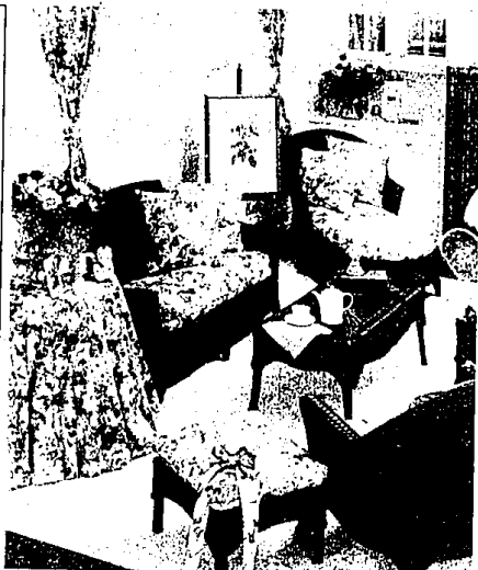
Furniture designers said the selection of fabrics "is all so subjective. We have to make an educated guess and go from here."

Robbins Executive Park West (800 Bldg.) — 800 Stephenson; built in 1980; 48,200 square feet; 100 percent occupancy; rental rate of $14/square foot plus electric.