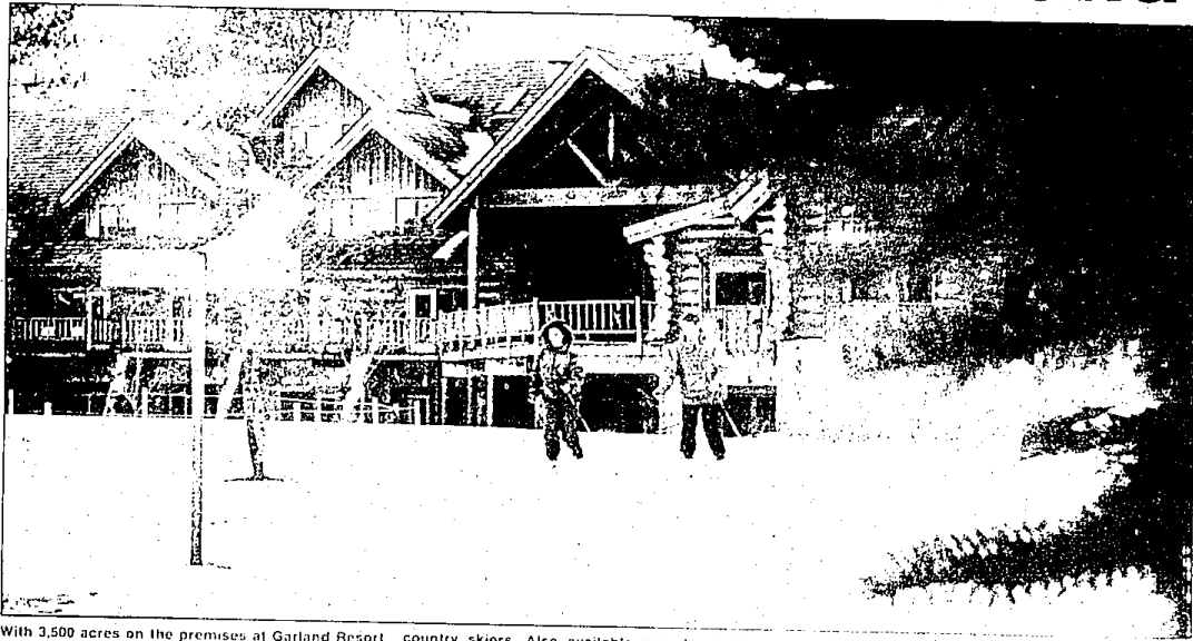
With 3,500 acres on the premises at Garland Resort near Gaylord, there's plenty of elbow room for cross-

country skiers. Also available are sleigh rides, gourmet lunch ski tour, ice fishing, ice skating,