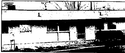
This is the house on Briarcrest in the Franklin Knolls subdivision, south of 14 Mile, that Farmington Hills police and agents with the federal Bureau of Alcohol, Tobacco and Firearms raided Feb. 11. Agents seized a cache of firearms and weapons.

ATF agents are continuing their investigation of the weapons and other devices, such as homemade pipe bombs, electric blasting caps, timing devices and two suspected