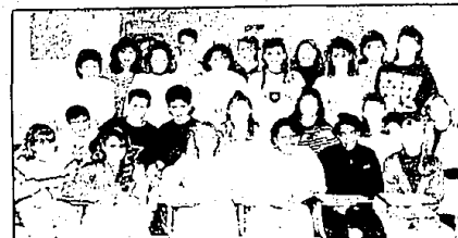
The East Middle School eighth grade choir has sent this class picture along with an audio tape with a "coming home" theme to some 30 service people in the Persian Gulf. They plan to continue their mailings, despite the recent cease fire.