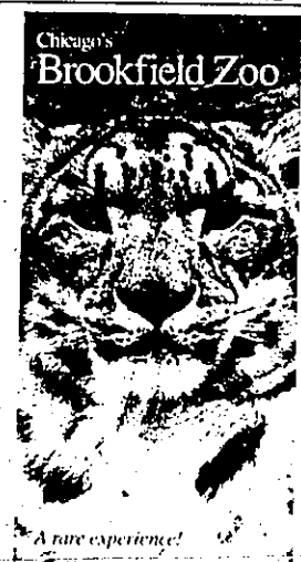
A rare experience!

Open every day of the year, Chicago's Brookfield Zoo is an ever-changing wonderland. Whether it's Spring Eggstravaganza in April or a Holiday Magic evening in December, you'll find a fun-packed day awaiting you at one of Chicago's most popular places. Brookfield Zoo, located at 1st Avenue and 31st Street, is just 14 miles west of downtown Chicago, in Brookfield, Illinois. By car, take either I-55 (Stevenson) or I-290 (Eisenhower) expressway, or I-294 (Tri-State Tollway), and watch for the Brookfield Zoo exit sign.