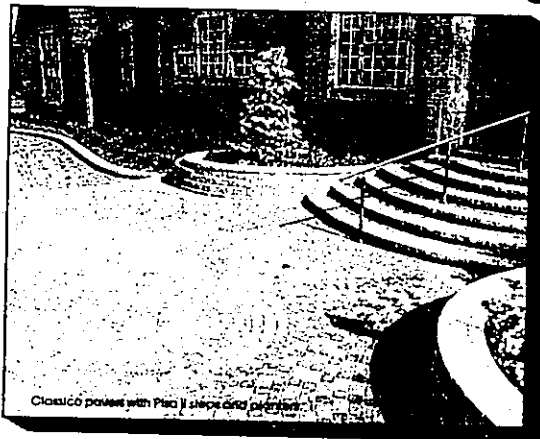
Classic paving with Pico II steps and planters