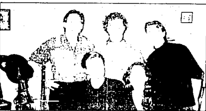
The five-member Only a Mother's latest CD, "Naked Songs for Contortionists," is being released this week by San Francisco-based Ralph Records.