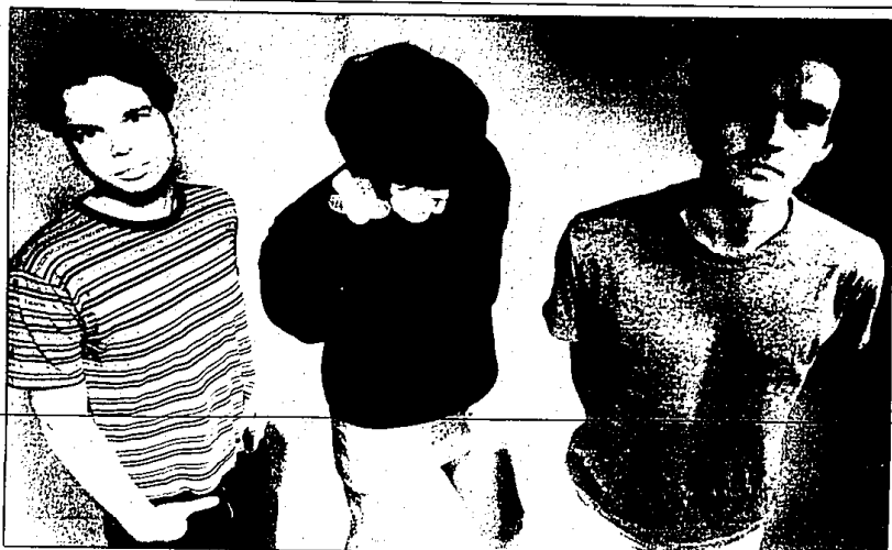
Some have put Galaxie 500 on a par with Joy Division in terms of atmospheric and the Feelies in terms of rhythmic quality.