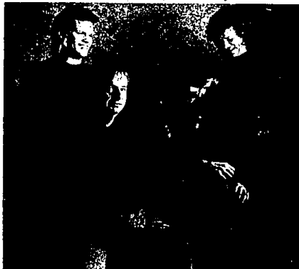
The Hoopsnakes perform Thursday-Friday at Sully's in Dearborn and Saturday at the Blind Pig in Ann Arbor.