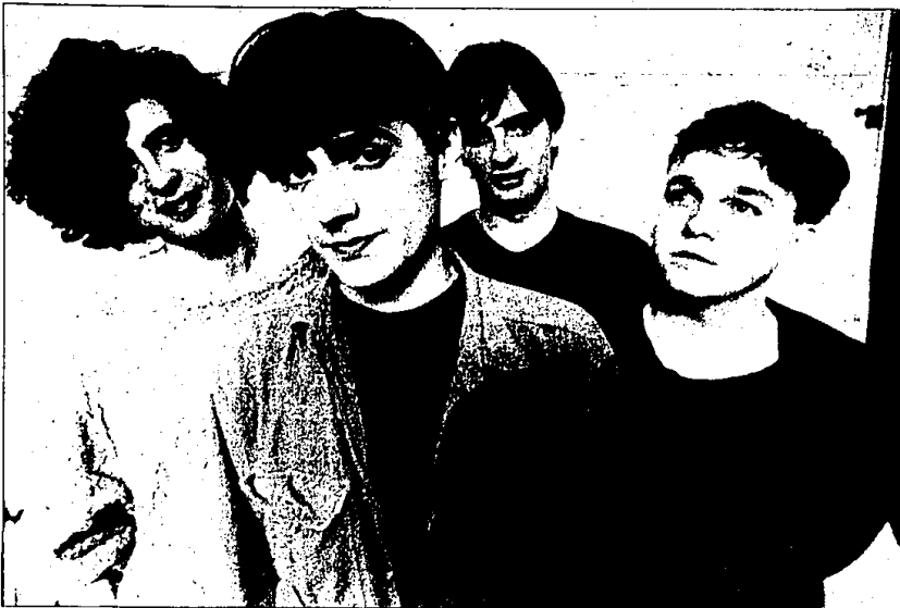
The Venus Beads, which emerged from musical obscurity with its first release, "Transfixed," is riding the same hard rocking, sonic vibe on its latest release, "Incession."