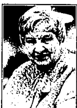
"Dimitri's in downtown Farmington . . . They have a varied menu and they seem to give special attention to senior citizens."