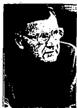
"Peabody's in Birmingham . . . The food is good, the prices reasonable."