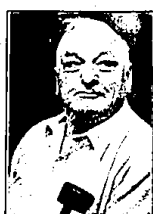
"Amantea's at Warren and Vanoy in Garden City . . . The veal parmesan is the best."