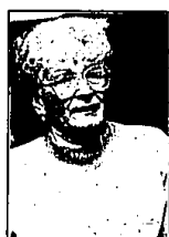
"The Novi Hilton . . . Everything is good."