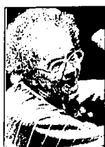
"Mountain Jack's here in Farmington . . . They have great fish and good service."