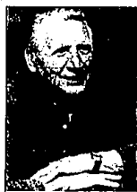
"Leone's on Seven Mile at Middlebelt . . . Good hospitality and excellent price."

We asked this question at the Mercy Center for senior citizens in Farmington Hills.