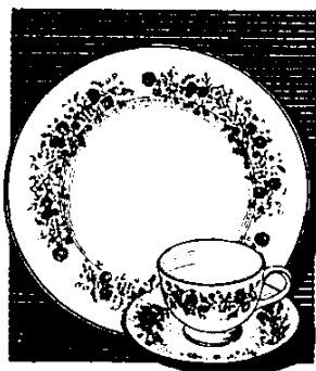
Belle Fleur by Wedgwood