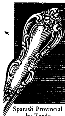
Spanish Provincial by Towle