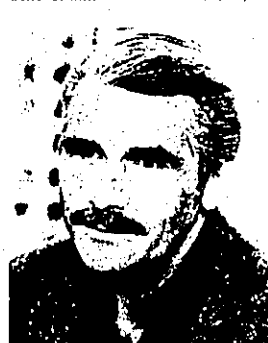
James Brolin stars in the thriller Nightmare on the 13th Floor , rebroadcasting on USA, Wednesday.

In "Never Cry Alien," Arthur pulls a prank that has everyone believing aliens are landing. The joke backfires when he sees a real UFO and nobody believes him.