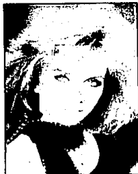
Barbara Mandrell appears Thursday, May 30, at the New Pine Knob near Clarkston.