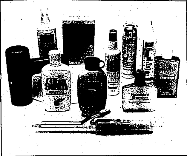
The newest products for summer hair care are available at F & M for less.