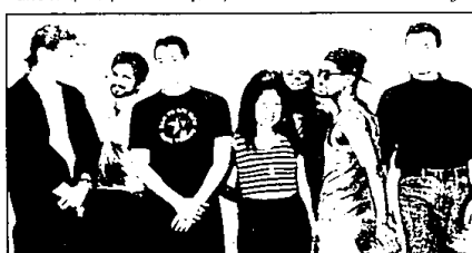
If you're in Ann Arbor Monday, May 27, stop by at Rick's Cafe, 611 Church. The 3rd Estate will be performing.