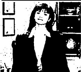
Victoria Principal is an outspoken mayor in Sparks: The Price of Passion , Friday on CBS.

There is still one person who refuses to capitalize on his relationship with Elvis Presley. Colonel Parker refused the latest offer to write a tell-all about Elvis from a publisher who discussed $2 million up front. Parker said his usual "not interested." He claims, "All the publishers want is dirt, and I'm not a dirt farmer."