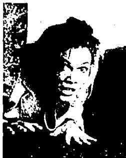
Kathleen Turner plays a novelist who finds danger in Romancing the Stone , Sunday on ABC.

Not bad for a kid, the second of ten, who grew up in the Fulton housing projects in Manhattan, N.Y.