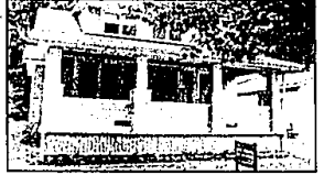
OPEN AND BRIGHT BIRMINGHAM HOME with contemporary interior has much upgrading and many recent improvements. Flexible floor plan. Three bedrooms. Basement. Central air. Deck. $139,900. (644-6300) 190050