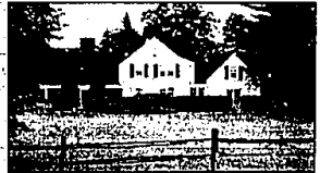
NEW ENGLAND COLONIAL in the City of Bloomfield Hills bordering Bloomfield Hills Country Club. Fine architectural detailing. New kitchen, banquet-sized dining room, four bedrooms, 3 1/2 baths. $479,000. (644-6300) 167377