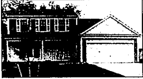
WONDERFUL SETTING at the end of a cut-de-sac overlooking downtown Rochester. Bay window dining room, family room with fireplace, three bedrooms, 2 1/2 baths, basement. A real jewel of a home. $149,900. (644-6300) 189905