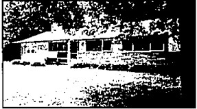
COUNTRY LIVING in the city. Wonderful large, treed rear yard. Functional floor plan. Many recent improvements including newer roof and freshly painted exterior. Ideally located on quiet street. $54,900. (851-5500) 188845