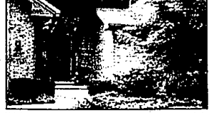
MAGNIFICENT BLOOMFIELD HOME, which incidentally is a condo, has top-of-the-line customized features. Library, fireplace and lower level with family room and possible 5th bedroom and bath. Central air. (644-6300) 181725