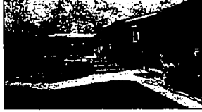
SPECTACULAR VIEWS OF deeply wooded ravine. Dramatic living room, updated kitchen with Heritage oak cabinets, fireplace in family room, finished walk-out basement. Approximately 3.77 acres. Rochester. $239,900. (851-3500) 094824