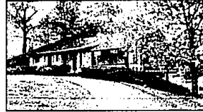
MEADOW LAKE FRONT. Well designed, quality contemporary affording lake living with city convenience. Three bedrooms, 2 1/2 baths, family room, library and two fireplaces. Central air. Great living! $329,000. (644-6300) 185114