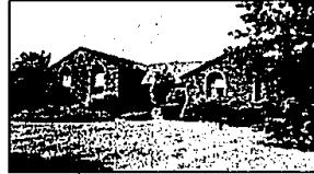
IDEAL FAMILY HOME in a popular sub. Bloomfield Square, Birmingham Schools, Walnut Lake privileges. Ceramic foyer, newer carpet in living room. Four bedrooms. Beautiful rear yard with pool. $299,000. (851-5500) 186538