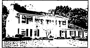
NEAR LINCOLN HILLS GOLF COURSE. Lovely treed setting for 4 bedroom colonial with family room, den and sun room. Fine woodwork and hardwood floors. Near St. Regis, expressways and good shopping. $245,000. (644-6300) 185689