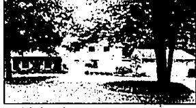
GRACIOUS, ARCHITECT DESIGNED COLONIAL on large private site with a wildflower garden. Four bedrooms with first floor master suite, family room and two fireplaces. Close to Birmingham. $359,000. (644-6300) 190057