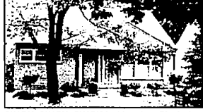
CHARM, CHARM, CHARM in this unique Birmingham bungalow with 3 bedrooms and 2 baths. New master suite on 2nd floor with walk-in closet. Family room. Private rear yard. Very special! $122,500. (644-6300) 187449