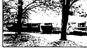
BLOOMFIELD HILLS FOUR BEDROOM RANCH with 20' x 23' family room in private wooded setting. Fireplaces in living and family rooms. 31' deck. Much updating. Very convenient location. $164,900. (644-6300) 188242