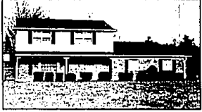
INGROUND SWIMMING POOL, a half-acre site and a lovely three bedroom, 2 1/2 bath colonial with newer kitchen, cozy family room, first floor laundry, central air. Many extras. Must see this one. $179,900. (644-6300) 182614