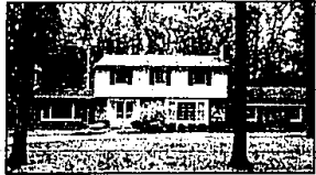
1.5 WOODED ACRES in desirable Lone Pine Road Estates. 4 bedroom, 2 1/2 bath center entrance wing colonial with nicely updated neutral decor. Newer circular drive. Gilbert Lake privileges. $399,000. (644-6300) 185621