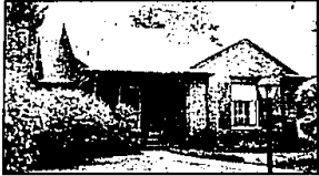
IN-TOWN BIRMINGHAM! This custom built one owner home has large first floor master suite with dressing room and two bedrooms upstairs. Raised hearth fireplace. Family room. Indoor barbecue. $214,900. (644-6300) 190166