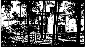
A TRULY UNIQUE CONTEMPORARY walk-out ranch with unbelievable custom features thru-out. Gourmet kitchen. Carross nature from an outstanding great room with windows that reach to the stars. $287,000. (851-5500) 187607