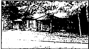
MOVE RIGHT in this attractive and affordable Birmingham ranch with three bedrooms. Family room with doorwall to deck overlooking large, treed rear yard. Updated kitchen. Extra deep garage. $103,000. (644-6300)