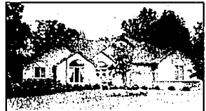
GREAT LOOKING 1988 TUDOR in Bloomfield Hills. First floor master, library, custom kitchen. Lower level rec room with fireplace, 4 bedrooms. Lovely deck. 3 car garage. Bloomfield Hills Schools. $435,000. (644-6300) 182376

Let's get acquainted and find that just-right home for you.