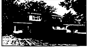
LAKE PRIVILEGES on Indianwood Lake with sandy beach for residents only. 4 bedrooms, 2 1/2 baths, marble foyer, 1st floor laundry, finished basement, wet bar. Oversized, heated garage with workshop. $169,900. (851-3500) 095345