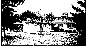
WARM AND INVITING HOME - That the right buyer will find charming. Tasteful country wallpapers and neutral carpet add a cozy touch to a very comfortable home. Unobstructed tranquil view from deck. $119,888. (851-5500)