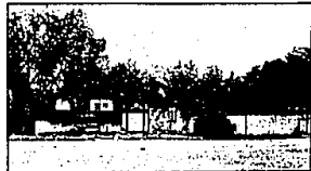
SPACIOUS QUAD-LEVEL with limitless possibilities. Beautiful wooded property with stream, Japanese garden with waterfall and bridge. New deck off living room. Four bedrooms, 2 1/2 baths. $209,900. (851-5500) 190018