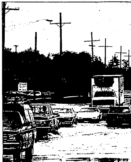
Traffic moves slowly through about a foot of water on Eight Mile between Farmington and Gill roads.