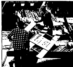
Workers prepare to put up barricades and signs following a flood Monday morning.