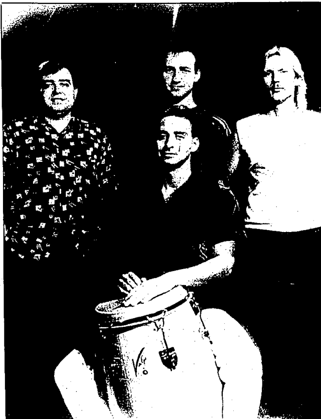
Chain Reaction has spent five years coming up with a sound that is both alternative and commercial. The end result is "Out of the Ruins."