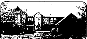
FARMINGTON HILLS. Impressive Ramblerwood Contemporary on a cul-de-sac. Showcases 4 bedrooms, 2 1/2 baths, living room with Italian marble fireplace, formal dining room, library and 1st floor laundry. Chef's kitchen. Perfect. $275,000 651-8100 06-B-6101