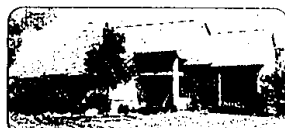
OPEN SUN. 2-5, 4925 Oak River Blvd., Troy, N. of Waukegan, E. of Coolidge. Flowing 3 bedroom Contemporary. Two-story foyer, 2 1/2 baths and family room with fireplace that opens to deck and large yard. $279,900 646-6000