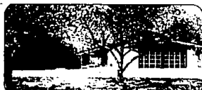
SOUTHFIELD. Absolutely fantastic custom Contemporary. Offers skylights, decks, patio, pool cabana and large windows for wonderful views. Walk-out lower level has 5th bedroom, office and rec room. Four full and 3 half baths. Must see!! $290,000 626-9100