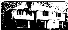
BERKLEY. Stately 3 bedroom Colonial with new decor. New carpet and paint. New furnace and air. Newer roof and water heater. Living and family room fireplaces. One of the largest homes in the area and on an extra wide lot. $144,800 689-8900