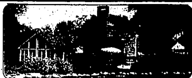
WEST BLOOMFIELD. Like a jewel on the point of interlaken and engulfed by Pine Lake sets this unparalleled home. Features gold fixtures, extensive marble, 3 fireplaces and wraparound deck. Rooms include sun room, media room, living room and 4 bedrooms including a master suite with fireplace and marble bath. $1,999,999 851-8100