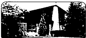
WEST BLOOMFIELD. Keep your horses in the barn of this 4 acre Contemporary with Upper Strals access. With minor updating, this will be a dream house. Offers 4 bedrooms, 2 1/2 baths, Florida room and great room with fireplace. Central air. $254,900 851-8100