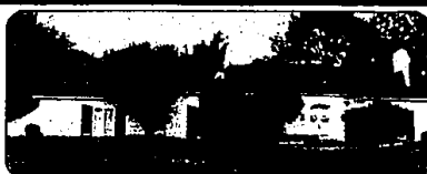
BLOOMFIELD HILLS. Outstanding 5 bedroom home completely renovated in the best of taste and materials. Exquisite new garden room and European courtyard. European gourmet kitchen pleases the fussiest chef. Remodeled master suite with granite fireplace, walk-in and wall closets and updated bath. Must see to believe! $679,900 646-6000 01-B-6211