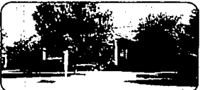
TROY. Move right in to this 3 bedroom custom built home. Offers new carpet, sprinklers, hot water tank and newer air conditioning. Finished basement. Library could be dining room or 4th bedroom. Outstanding condition! $209,500 689-8900 05-A-5981