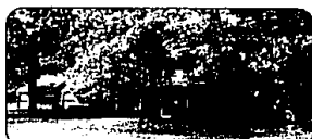
WEST BLOOMFIELD. Bloomfield Hills schools. Over 3,000 sq. ft. Move-in condition in an area of more expensive homes. Three bedroom home with master on 1st floor. Newer roof, French doors, skylights and more! Lake privileges. $239,900 646-6000 01-B-6212