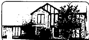
OPEN SUN. 1-4, 1231 Prosper, Troy, N. of Square Lake, W. of Crooks. Vacation at home with a pool and deck! Neutral decor with 4 bedrooms, 2 1/2 baths and newly finished basement. Fireplace in family room and built-ins in library. $239,800 689-8900