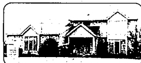
TROY. Sharp 2-story with contemporary flair. White cabinets and light flooring. Cathedral ceiling and marble fireplace in family room. Offers 3 bedrooms, 2 1/2 baths, tiled basement and 1st floor laundry. Extra storage in garage. $176,800 689-8900 05-A-6061