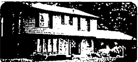
FARMINGTON HILLS. Dynamite 4 bedroom home on a wooded court. Everything is new in the last 4 years, from the roof to the landscaping. Formal dining room, library, 2 1/2 baths and living room. Family room with fireplace. $159,900 626-9100