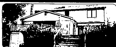
WEST BLOOMFIELD. Green Lake front home. Totally rebuilt in 1987, this 3 bedroom home is high quality throughout. Luxurious master bath with jacuzzi tub and separate shower. Antique doors, ceramic floors, walk-out lower level and 4 full baths. Offers a formal dining room, library and fireplaces in living and family rooms. $429,000 851-8100 06-B-6104