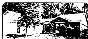
WEST BLOOMFIELD. Beautiful 4 bedroom, 3 bath Ranch Condo with walk-out lower level. Formal kitchen with Jenn-Air. The neutral interior highlights a formal dining room, rec room, breakfast nook and 1st floor laundry. Great room fireplace. $229,000 851-8100