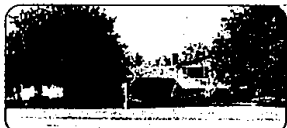
ORCHARD LAKE. Newly decorated, 4 bedroom split-level home with Orchard Lake beach and boating privileges. One and one-half acre lot with inground pool. Offers 3 1/2 baths, 2 fireplaces, formal dining room and 3 car garage. $298,500 851-8100 06-B-6201