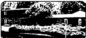
FARMINGTON HILLS. Custom 4 bedroom home on a private treed lot with a pond. Offers a formal dining room, library, 1st floor laundry, 3 1/2 baths and 3 fireplaces. Newer roof. Heated garage, large patio, central air and security system. $299,000 626-9100 02-B-6191