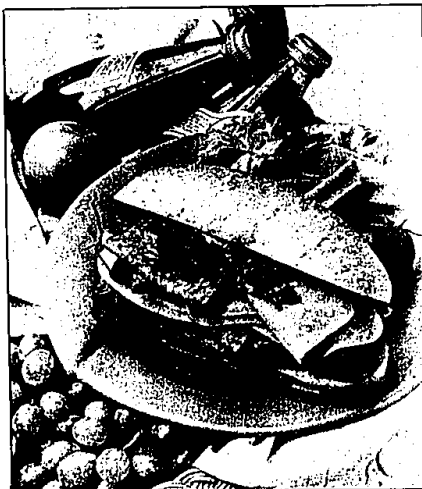
Ham and Salami Bistro Baguettes dress up any picnic menu.

Pitted and chopped Niçoise olives may be substituted for ripe olives.