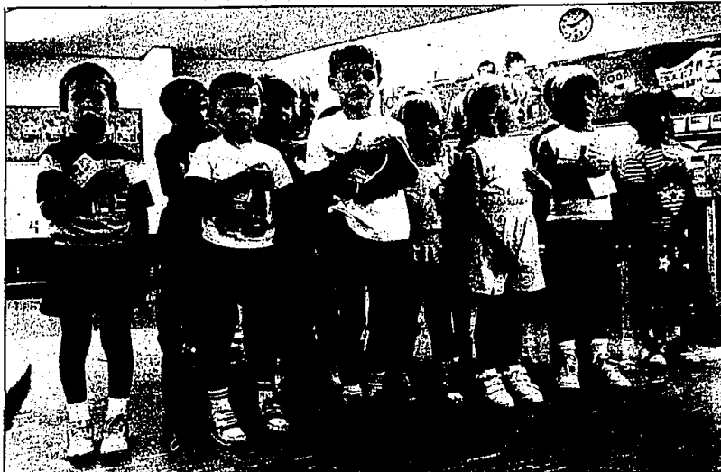
Kindergarteners recite the Pledge of Allegiance on the first day of school.