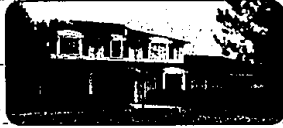
WEST BLOOMFIELD. Gracious 4 bedroom Colonial with a private yard. Large foyer with circular staircase. Wonderful kitchen. Family room with fireplace and doorwall to patio and gazebo. Finished basement with hot tub. $240,000 851-8100