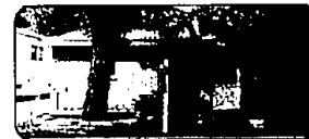
BERKLEY. Contemporary and clean 2 bedroom Ranch in north Berkeley. Stone fireplace in large living room. Country kitchen with all new appliances. New roof and fresh exterior paint. Washer and dryer included. Perfect for investors. $63,900 646-6000 01-B-6265