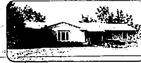
BLOOMFIELD HILLS. Stunning 3 bedroom walk-out Ranch overlooking Hammond Lake. New European kitchen, windows and doorwall. Freshly painted. Formal dining room, rec room, 3 baths and family room with fireplace. Central air. $185,000 626-9100