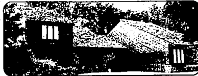
ORCHARD LAKE. Orchard Lake woodland. A soft Contemporary with vaulted great room. Four bedrooms, 3 1/2 baths. Extensive use of oak floors. Glass and decking. Finished lower level to pool. Professionally landscaped and more. Call for your private showing. Asking $415,000. 651-8100