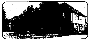
TROY. Prestigious Oak River sub offers this 4 bedroom home. Large screened porch overlooks the landscaped yard. Gourmet kitchen with butler's pantry. Formal dining room and fabulous family room with fireplace. $389,000 646-6000