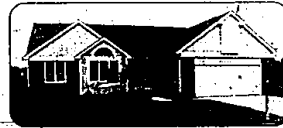
ROCHESTER HILLS. Contemporary 3 bedroom Ranch. Highlights include the ceramic foyer, marble trimmed fireplace and the master bedroom with jacuzzi. Gourmet kitchen, den, formal dining room and finished walk-out lower level. $187,500 651-8850