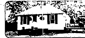
OPEN SUNDAY 1-4. 20757 Negaunee, Southfield, N. of 8 Mile, E. of Inkster. Remodeled 4 bedroom Ranch. Newer roof, bedroom windows, paint and carpet. Living room, kitchen with nook, rec room and bonus room. Great terms. $56,888 626-9100 02-B-6219