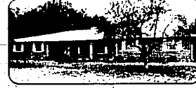
ECHO ROAD. Prime Bloomfield location on a cul-de-sac street South of Lone Pine. Sharp 4 bedroom Ranch highlights new carpeting, kitchen floor and brick patio. Offers 2 1/2 baths, formal dining room, living and family room fireplaces. $234,900 626-9100