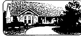
FARMINGTON HILLS. Desirable Cape Cod blends traditional and contemporary style. First floor master suite with jacuzzi and shower. Two-story great room with fireplace. Finished lower level with 4th bedroom, bath and kitchen. Much more! $254,900 626-9100