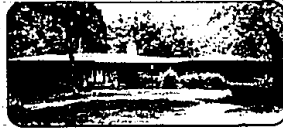
BEVERLY HILLS. A picturesque river runs through the approximately 1.5 secluded acres of this 4 bedroom Ranch. Beautiful finished kitchen and breakfast area. Family and great room fireplaces. Walk-out lower level, 4 baths and library. $349,500 851-8100 06-B-6075