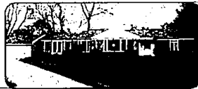
BIRMINGHAM. Walnut Lake privileges come with this 3 bedroom Ranch. Offers 2 fireplaces and an updated kitchen. Dining room, Florida room, rec room, family room and 1 1/2 baths. Walk-out lower level. In a tree setting on approximately one acre. $189,900 851-8100