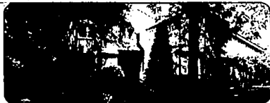
BLOOMFIELD. Fabulous 4 bedroom Contemporary home in a large parklike setting. Formal dining room with built-in cabinet and mirrors. New custom kitchen with large breakfast area. Library with built-ins. Fireplaces in great room and master bedroom. Custom landscaping adds the final touch to this too good to be true home! $249,900 628-9100 02-B-5966