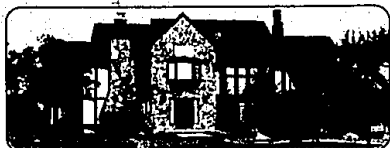
BLOOMFIELD HILLS. Custom built executive home showcases a 2-story family room with fireplace, open to library/media room. Formal living room with fireplace—huge dining room—large kitchen with breakfast room—4 bedrooms and 3 full and 2 half baths. Finished lower level. Custom features throughout. $699,900 851-8100 06-B-6168