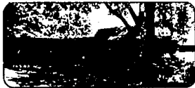
BLOOMFIELD HILLS. Contemporary multi-level home on a hillside lot with pool. Two master suites and 2 additional bedrooms. Finished walk-out lower level with fireplace. Extensive decking, built-ins and recessed lights. New roof. $369,900 646-6000