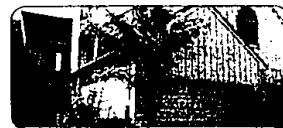
FARMINGTON HILLS. Contemporary Ranch. Condo with private entrance. 2 bedrooms, 2 baths, formal dining room, 1st floor laundry and many upgrades. Marble fireplace in living room. Family room, formal dining room and Euro kitchen. $114,500 626-9100