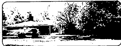
BLOOMFIELD HILLS. Updated, 3 bedroom Ranch on almost 1 1/2 acres of lush grounds. Appointments include hardwood floors, Berber carpeting, 3 fireplaces and a walk-out lower level. The grounds include an inground pool. $429,900 646-6000 01-B-5774