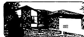
TROY. Charming 3 bedroom Ranch highlights a great room with elevated ceiling, skylight and fireplace. Country kitchen with pantry and wood cabinets. Full basement, breakfast nook and 2 baths. Private fenced yard. Central air. $116,900 689-8900 05-A-6271