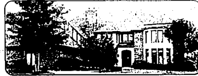
TROY. Custom built home in Troy's most prestigious sub, Oak River. Premium lot backs to a creek. This 4 bedroom home features neutral decor, custom crown moldings and a beautiful oak fireplace. Skylights, cathedral ceilings and custom brickwork. $409,500 851-8100