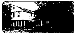
ORCHARD LAKE. Classic 4 bedroom home. Master suite with sitting room and balcony. Says in living and dining rooms. Built-ins and fireplace in family room. China cabinet built-in in the kitchen. Offers a dining room, library, breakfast nook and great room with fireplace. $219,000 851-8100