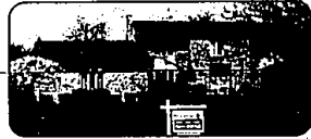
ROCHESTER HILLS. On a private cul-de-sac, this 4 bedroom home backs to a pond and commons area. China cabinet built-in in the kitchen. Offers a dining room, library, breakfast nook and great room with fireplace. $249,000 651-8850 04-A-5794