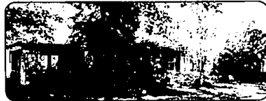
FRANKLIN. Exceptional 5 bedroom home in a ravine setting in Franklin's historical district. Features a heated carriage house accommodating 4 cars or studio. First floor master suite. Newer oak kitchen with premium appliances. Breakfast room, library, large porch and 3 1/2 baths. Lower level in-law suite. $475,000 646-6000 01-B-6274