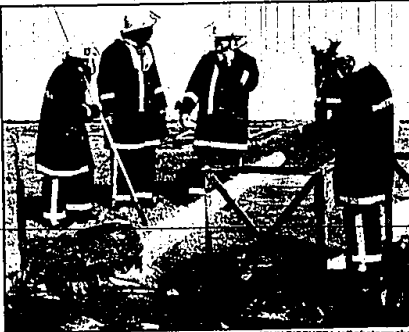
Farmington public safety officers hose down boxes filled with used paint chips which had caught fire in a manufacturing oven in Mills Products Thursday about 3:30 p.m. The fire, contained to the oven, caused smoke to billow through the building which had to be evacuated.