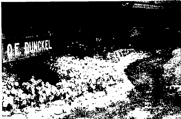
Redesigned flower beds grace O.E. Dunckel Middle School on 12 Mile Road in Farmington Hills.