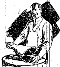
SPECIAL FOR SATURDAY