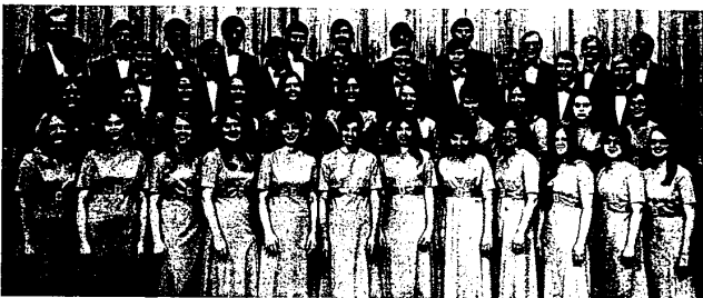
FIFTY VOICES of the Taylor University Chorale will be heard in Farmington when the chorale sings at the 9:30 a.m. Easter service in