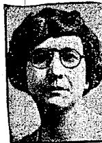
Republican Candidate for REGISTER OF DEEDS Oakland County Will greatly appreciate your vote at the General Election TUESDAY, NOVEMBER 2, 1926